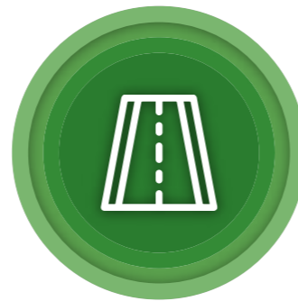
Wide Internal Roads