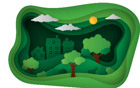
Experience the Lush Greenery During your Leisurely Strolls Landscaped roads with tree lines