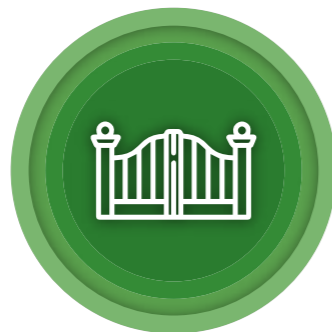
Secure Gated Complex