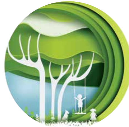
Let your Children Discover their Own Worlds. Toddlers Zone.