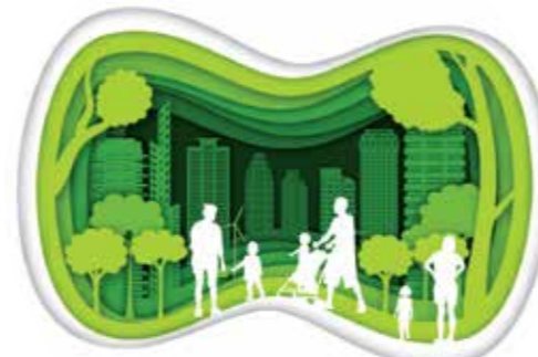
Build a Social Network in the Real World. Community Space.