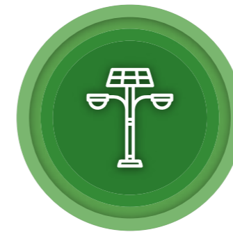
Well lit streets