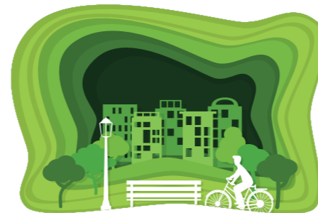
Bask in the Serenity of Tranquillity. Gazebo Seating