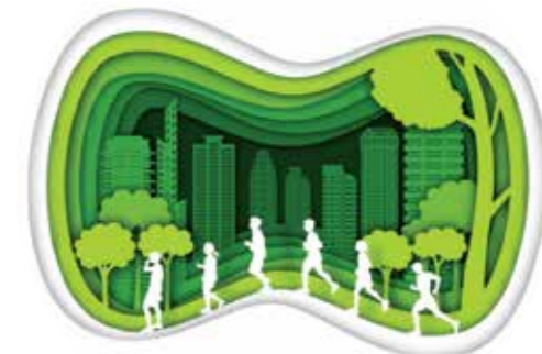
A Canopy of Green for your Long Walks. International Topiary of Trees,