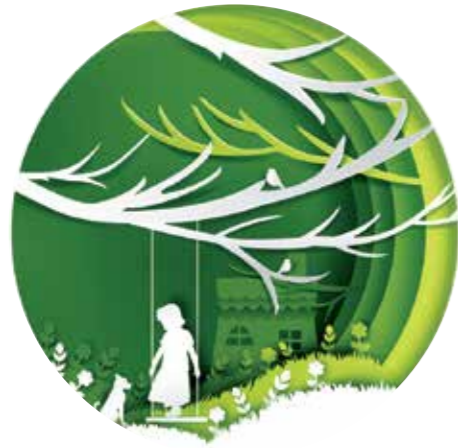
Relax in the Company of Peace and Tranquility. Landscaped Entrance with Water Bodies.