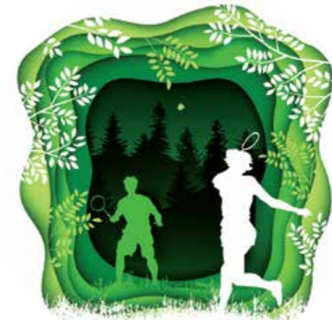
Indulge in an Active Lifestyle. Badminton Court.