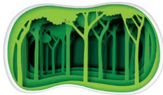
Let your Feet have Conversation with Grass. Lush Green Lawn Area, Gazebo Seating.